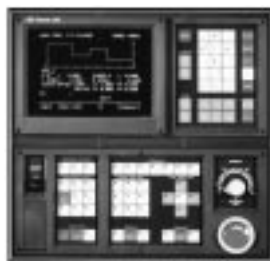
CNC Control Systems