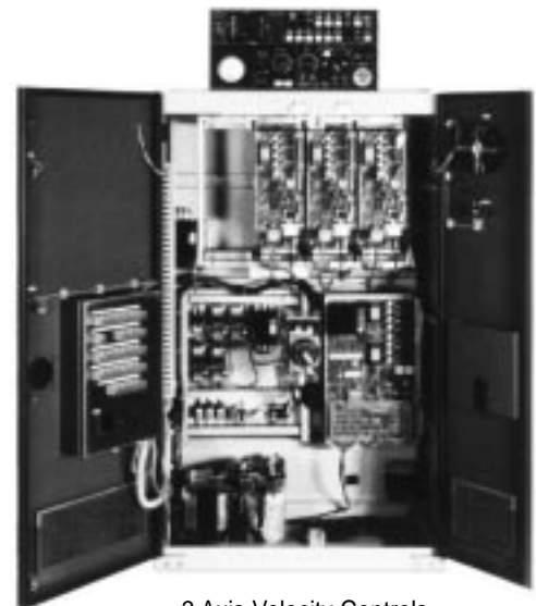
3 Axis Velocity Controls