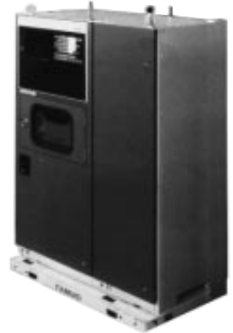
CNC Control Systems