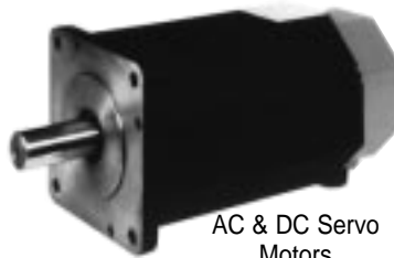
AC & DC Servo Motors