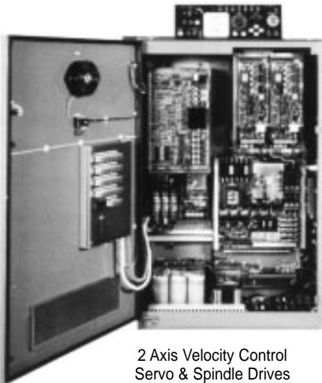
2 Axis Velocity Control Servo & Spindle Drives