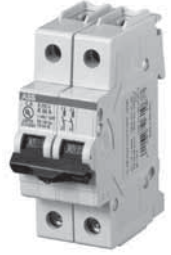
S202U-Z, 2 pole