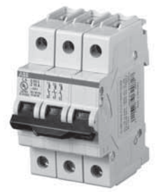
S203U-Z, 3 pole