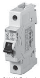
S201U-Z, 1 pole

Z UL 489 CSA C22.2 - NO. 5 VDE 0660 Cable & equipment protection