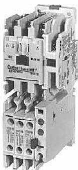
IEC Size D Cat. No. AE16DN0BC

Note: For more information, see CA03402001E.