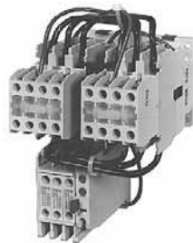
IEC Size F Cat. No. AE56DN0BC