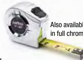
Also available in full chrome