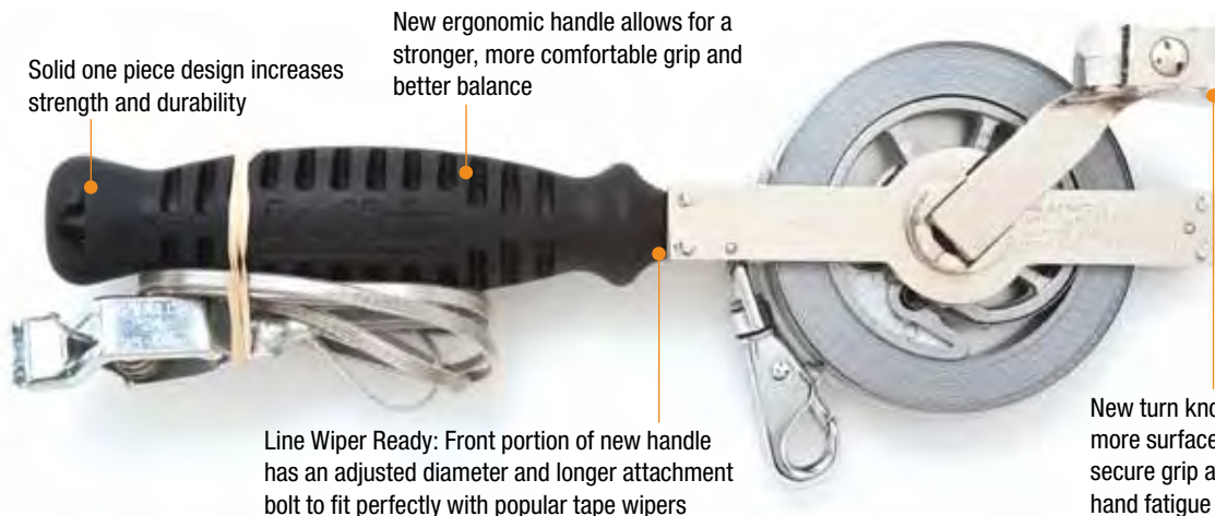
Solid one piece design increases strength and durability