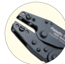
Rugged, double-plated jaw design for increased life span