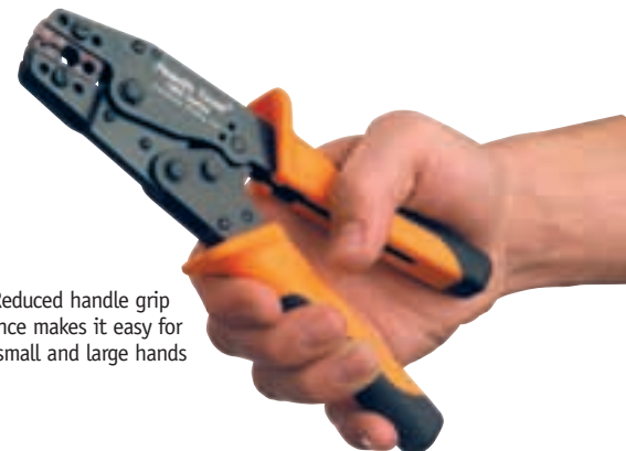
Reduced handle grip distance makes it easy for both small and large hands

See pg. 47 for our 1600 Series Crimpers & Die Sets